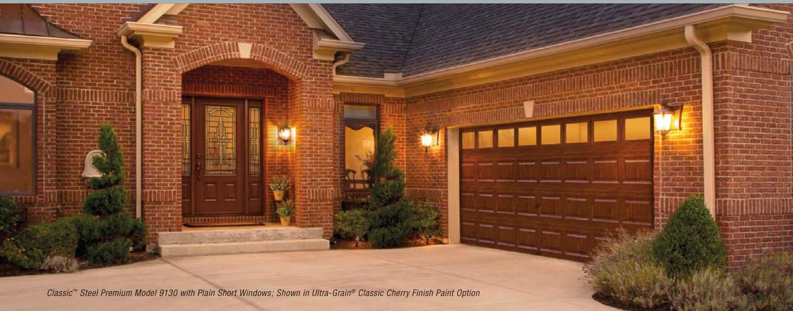
Classic™ Steel Premium Model 9130 with Plain Short Windows; Shown in Ultra-Grain® Classic Cherry Finish Paint Option