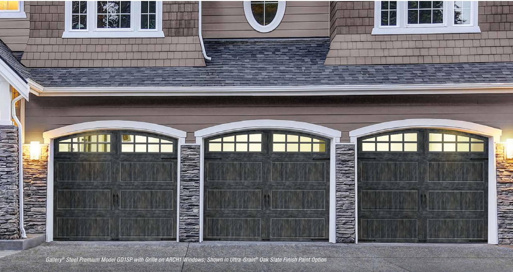
Gallery ® Steel Premium Model GD1SP with Grille on ARCH1 Windows; Shown in Ultra-Grain ® Oak Slate Finish Paint Option